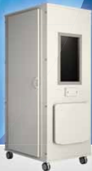
Configuration PRO 28F SLIM