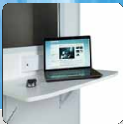
Folding table and connecting