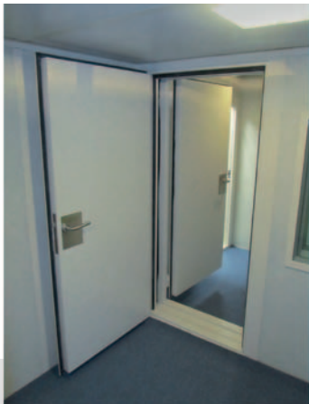
DW internal with double door