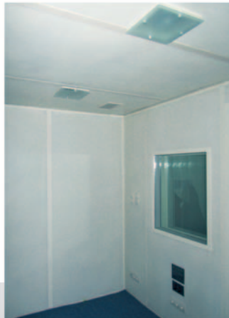
Internal view in perforated steel