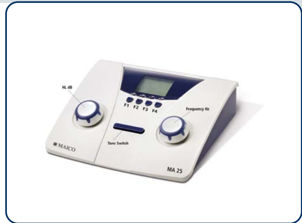
MA 25 function buttons

The MA 25e extends the MA 25 functionalities with an automatic test according to Hughson-Westlake. Parameters can easily be adapted to your personal preferences. The Talk Forward function makes the MA 25e easy to work with particularly in sound booth installations.